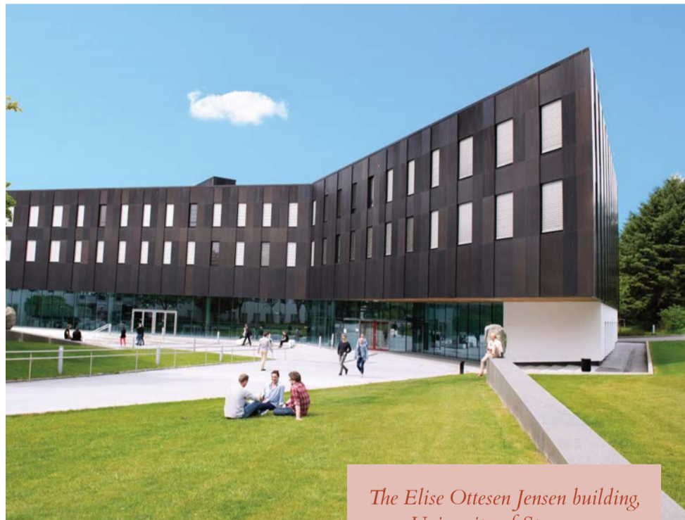
The Elise Ottesen Jensen building, University of Stavanger

The Centre was established in 2007 by the University of Stavanger (UiS) and IRIS (now NORCE: "The Norwegian Research Centre") and was made possible through basic funding from the Gjedebo family worth NOK 50 million.